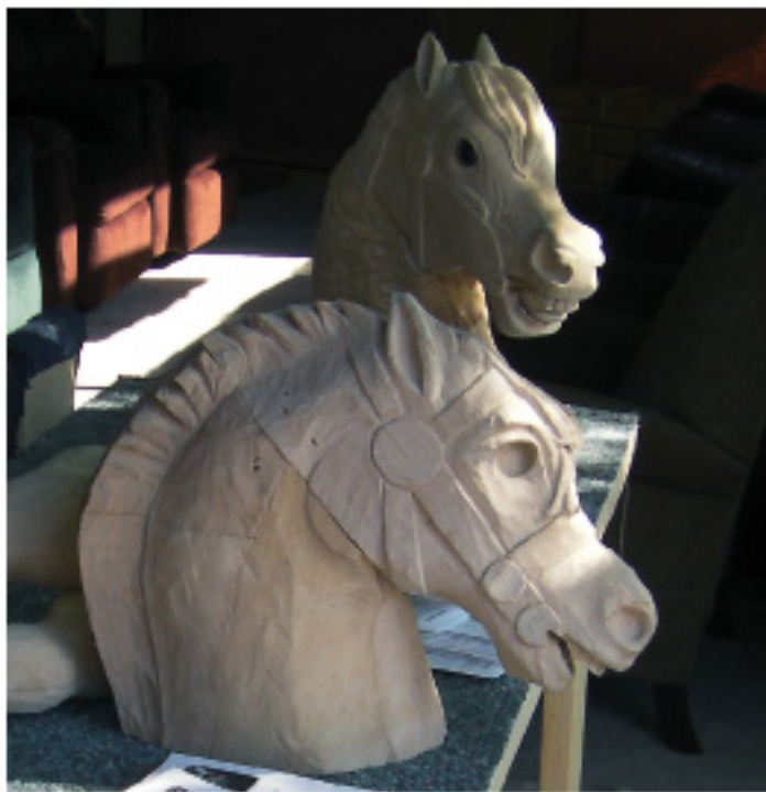
Two of the Kingsport Carousel horse heads on view in a storefront display where a carving demonstration was held in downtown Kingsport last spring.

for the Kingsport carousel which made for a total of eleven animals committed by nine carvers.