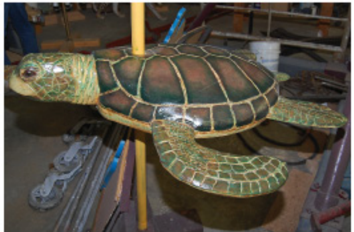
Bonnie Grant's sea turtle