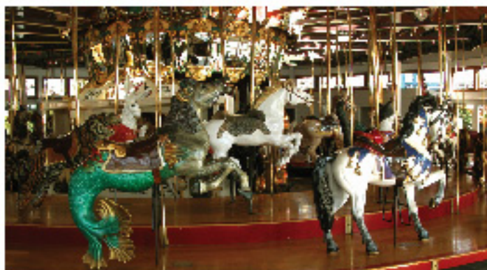
The downtown Chattanooga carousel above and below.