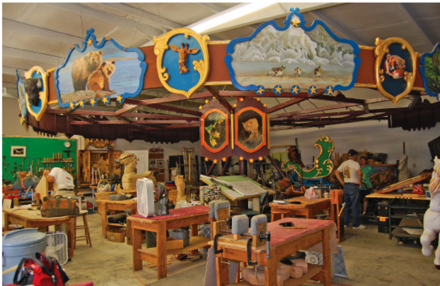
A new carousel and figures under construction at Horsin Around Carving School.